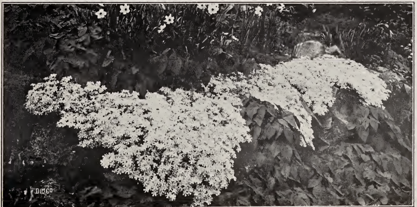
PHLOX SUBULATA (See page 32)

Thor. Not a new sort but becoming more and more popular because of its splendid, free flowering qualities. Color a beautiful shade of deep salmon pink, overlaid with a scarlet glow; small, aniline red eye. 25c. each, $1.80 per 10, $12.00 per 100.